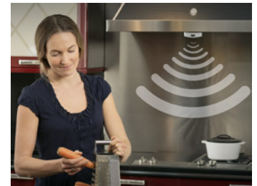
Intelligent Sensor on Cooker Hood

I came across the Innohome Stove Guard GGK500 some 5 years ago and since then it has undergone extensive development to help prevent cooker hob based fires. The Stove Guard system is made up of the Intelligent Sensor and the cooker Controller cut-off switch. The Intelligent Sensor is mounted on the