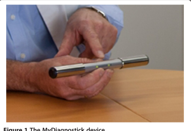
Figure 1 The MyDiagnostick device.

Participating general practitioners were asked to invite patients with known, paroxysmal or chronic atrial fibrillation to participate in the study. Furthermore, this convenience sample was added up with subjects without a history of atrial fibrillation. With the probability of finding a false positive result of 5% or less ( \alpha = 0.05 ), an estimated prevalence of atrial fibrillation of 50% in the study population, an expected sensitivity and specificity of 95% and a confidence interval of 4%, a sample size of 160 subjects was needed [13]. To end up with a prevalence of atrial fibrillation of at least 50% at the moment of the study the vast majority of the invited patients were people with a known history of atrial fibrillation (161/191) and only 30 people without a history of atrial